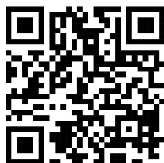
Drug Rehab Worship